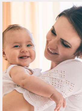
The Pregnancy Care Center of Rockford 2020 Year in Review

2020 reminded us what an amazing, constant, faithful God we serve. His promises are true, He will never leave us nor forsake us. The Pregnancy Care Center felt the Lord's presence every step of the way through one of the craziest years our world has faced. To say we are blown away by your generous giving last year is an understatement!