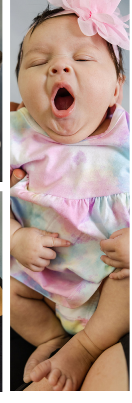
PCC Client Babies