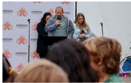
This year's Student Advisory Board!