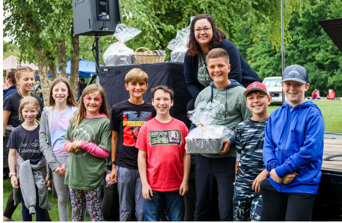
Rock Valley Bible Church was our Top Fundraising Team! Hallstrom was our Top Fundraising School!