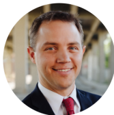
NOEL STERETT DALTON & TOMICH, PLC