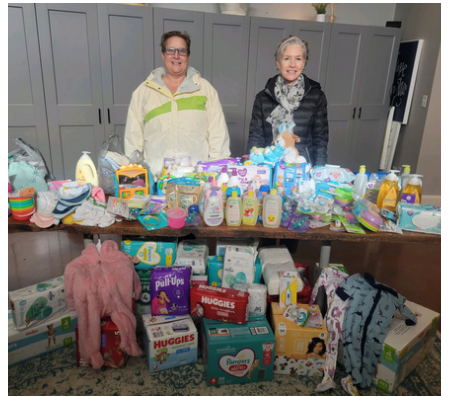
Shout out to OSF and their employee drive which brought us lots of donations! We are so thankful!