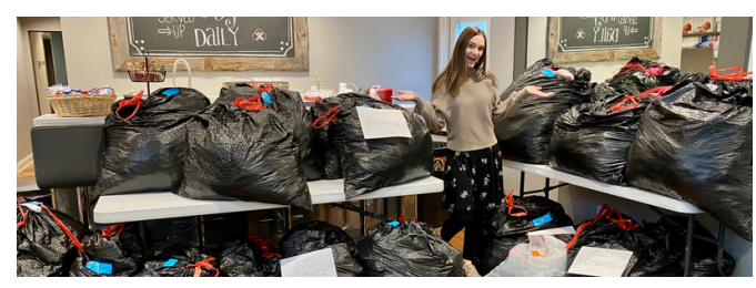
Shout out to Once Upon A Child for donating all of their leftover winter clearance clothes to us! They've done this several times now, and it's always a huge help in keeping our boutique stocked!