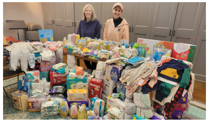
Thank you, St Bridget's Church Women's Group, for the many donations you collected for our boutique!