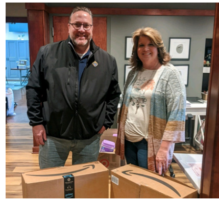
Thank you, Knights of Columbus-St. Rita's, for the brand new Pack n' Plays for our clients!